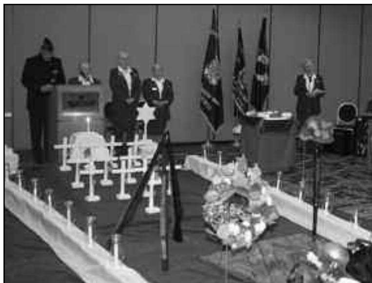
The Memorial Service.