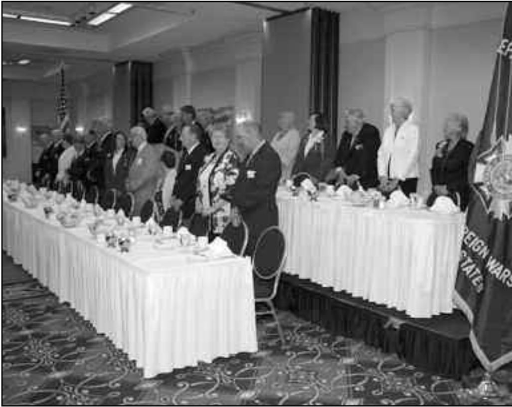
Head table at the Awards Banquet.