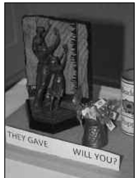
Another poppy display.