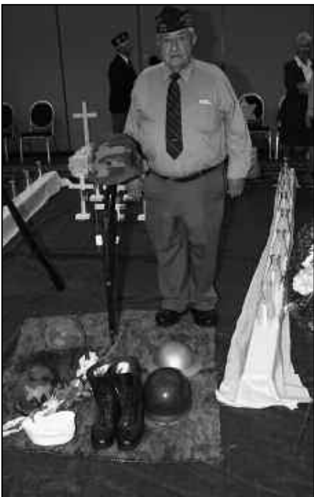
Setting up for the Memorial Service.