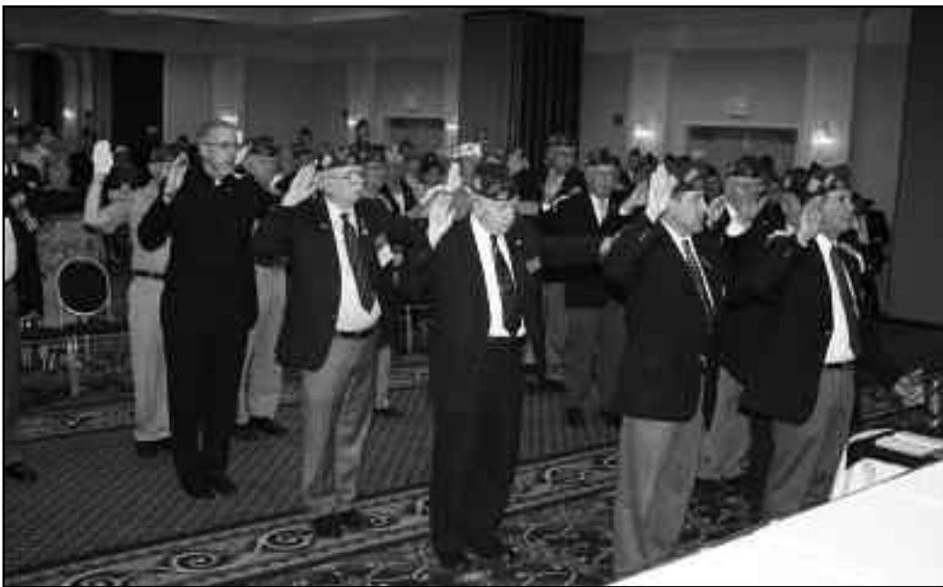
Installation of officers 2011-2012.